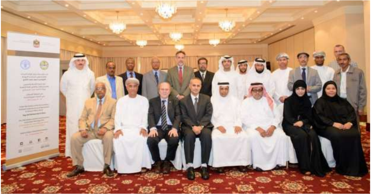
Participants of the 29 th Session and the 33 rd Executive Committee Meeting of the Commission for Controlling the Desert Locust in the Central Region, Dubai, United Arab Emirates, 23-27 November 2014.